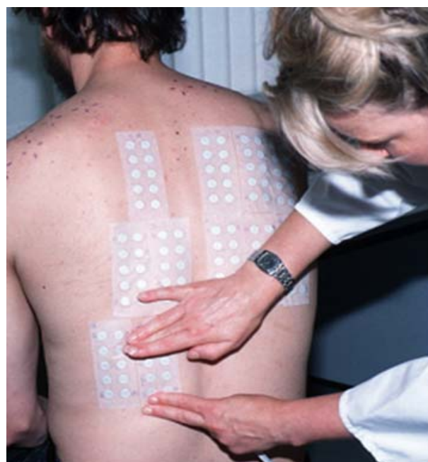
Fig. 2: ...is placed on the back of the patient