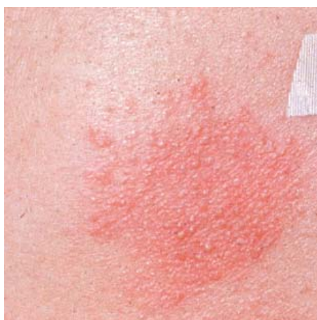
Fig. 3: An eczematous reaction after 72 hours indicates an allergy against the substance tested. This is not a "side-effect", but a clear diagnostic outcome.