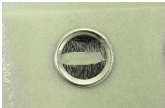
Fig. 1: A 20 mg petrolatum patch test preparation containing the allergen (e.g. 0.2 mg of the fragrance eugenol)

The chemical the individual is sensitized to is identified by the "patch test". (fig 1 - 3). In patch testing, a chemical suspected to cause contact allergy, e.g. a fragrance or a rubber compound, is applied in minute quantities on the skin.